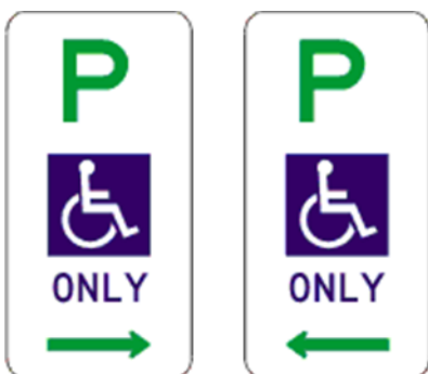
Figure 5. Proposed signage.