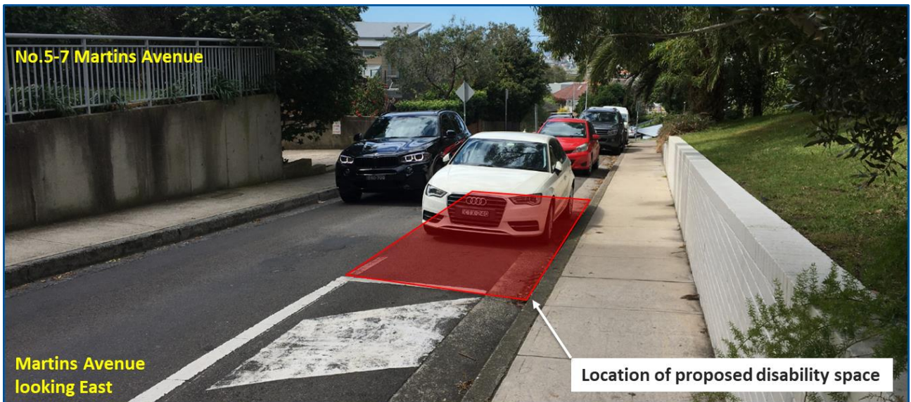
Figure 3. Martins Avenue looking east.

The proposed length is based on Australian Standard AS2890.5-2020 – On-street parking. This is shown in Figure 4.