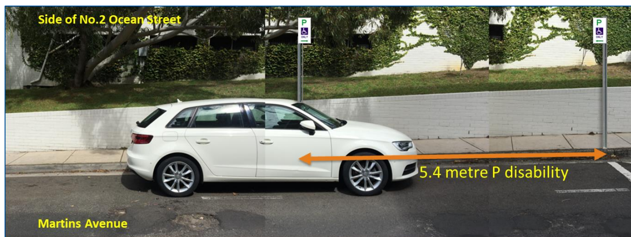
Figure 2. Location of proposed P Disability parking space.