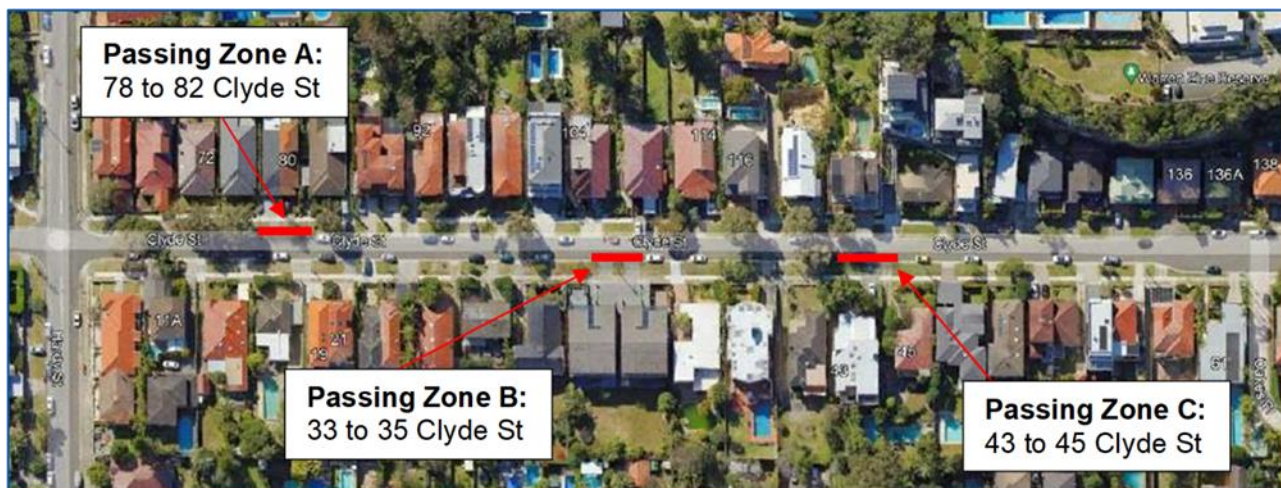
Figure 3. Proposed passing bays in Clyde Street.