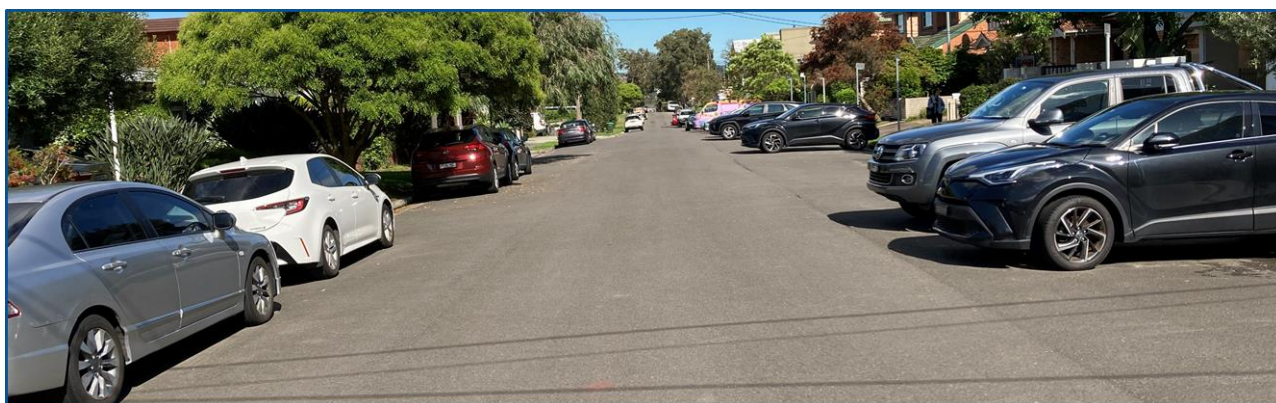
Figure 2. Clyde Street, facing east along the narrow section of the road.

There is no technical reason why the angle parking spaces should be removed. The parking and aisle widths comply with the requirements of Australian Standard AS2890.5 - 2020 - On-street Parking.