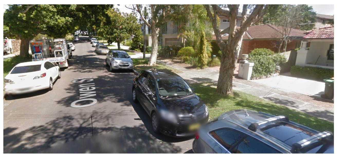
Figure 1: View of narrow carriageway in Owen Street near No.8

Given the widths of a standard small rigid vehicle (SRV) and medium rigid vehicle (MRV) are 2.3 metres and 2.5 metres respectively, allowing the existing, unrestricted parking opposite the proposed construction zone to remain in place would reduce the lane width for through traffic to below 3 metres depending on the size of truck that would be using the zone. Therefore if the construction zone is installed at No. 8, the removal of the parking spaces opposite the site will be required to maintain legal lane widths and the free flow of traffic.