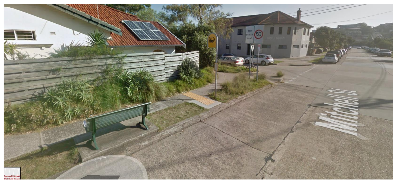
Figure 1.1: "J" stem /bus zone on south-western corner of Mitchell Street and O'Donnell Street

A bus zone is located on the south-western corner of the intersection. It is not proposed to install a 10m long "No Stopping" zone on Mitchell Street on the south-western corner as that will result in the bus zone and "J" stem having to be moved to the south.