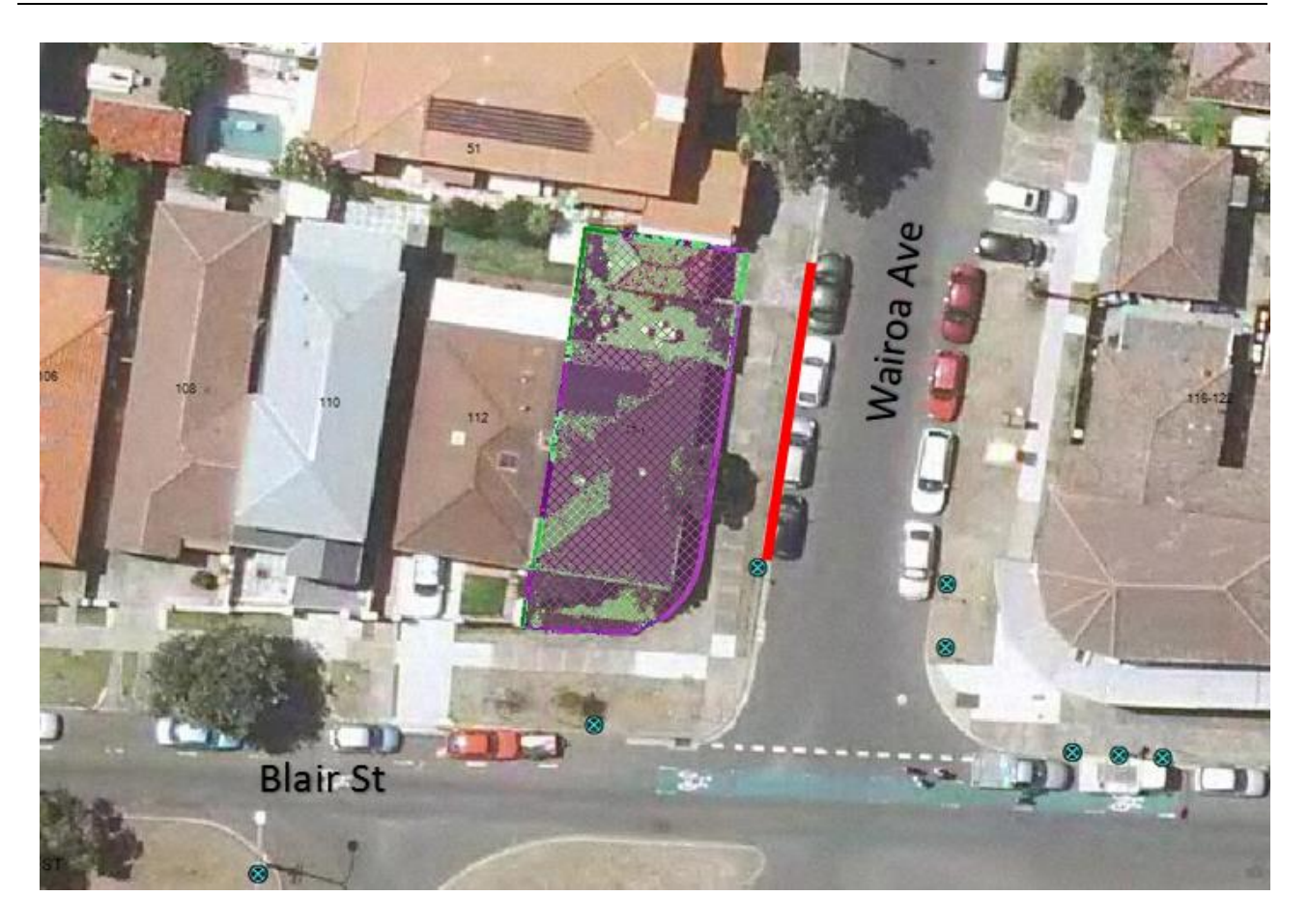
Figure 2: Aerial photograph of 114 Blair Street, North Bondi