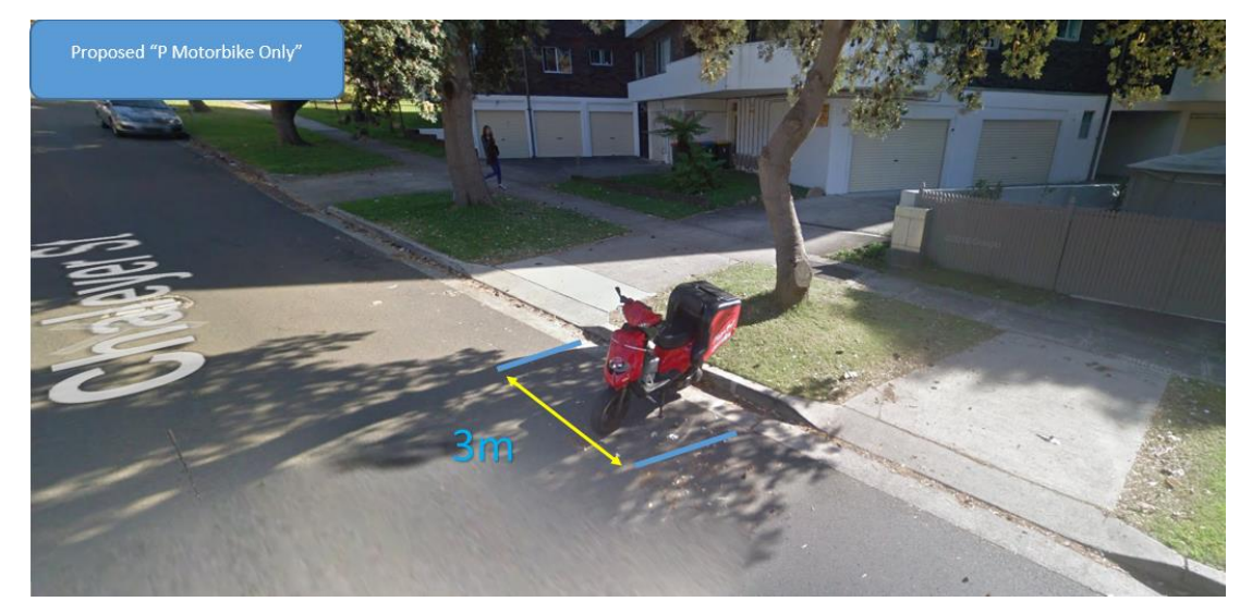
Figure 1: Street View of driveways at 459 Old South Head Rd (left side) and 2 Chaleyer St, Rose Bay.