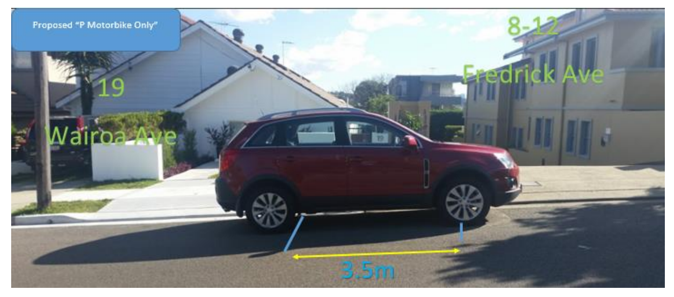
Figure 1 : Street View of driveways at 19 Wairoa Ave (left side) and 8-12 Fredrick Street, North Bondi