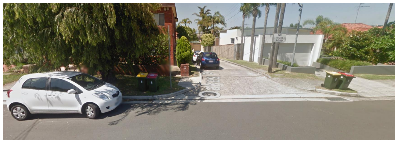
Figure 2.1: Oakes Place intersection with Clyde Street, North Bondi

As compliance is an issue at this location, it is recommended that the legislative requirements be signposted. This will not result in a net loss of legal on-street parking spaces.