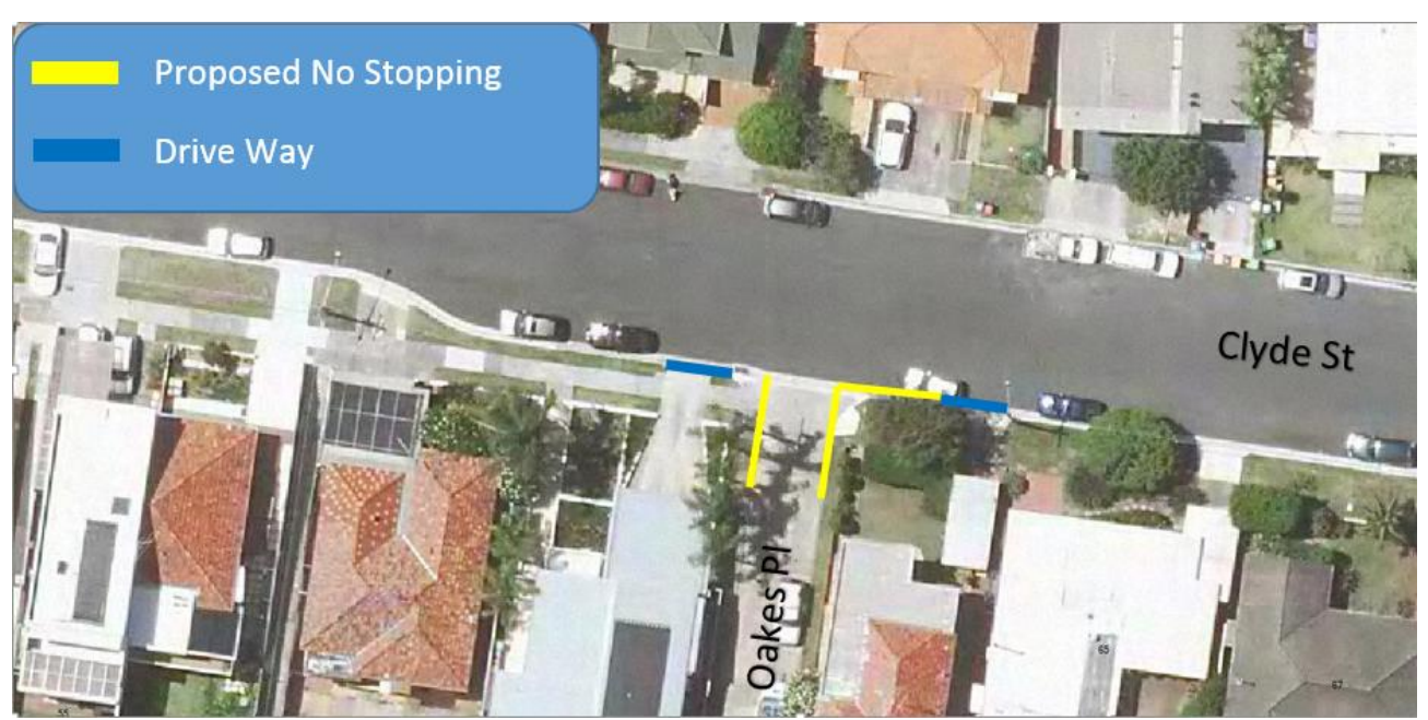
Figure 2.2 Proposed restrictions at intersection of Clyde Street and Oakes Place, North Bondi