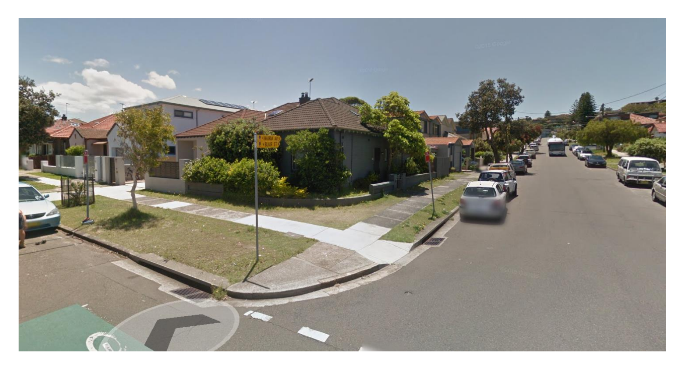
Figure1: 114 Blair Street, cnr Wairoa Avenue, North Bondi.