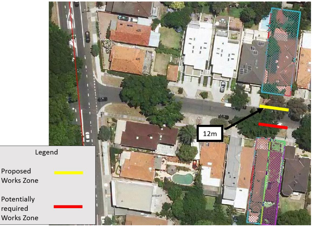
Aerial image of proposal at 8 Owen Street, North Bondi.

Given the widths of a standard small rigid vehicle (SRV) and medium rigid vehicle (MRV) are 2.3 metres and 2.5 metres respectively, allowing the existing, unrestricted parking opposite the proposed construction zone to remain in place would reduce the lane width for through traffic to below 3 metres depending on the size of truck that would be using the zone. Therefore if the construction zone is installed at No. 8, the removal of the parking spaces opposite the site will be required to maintain legal lane widths and the free flow of traffic.