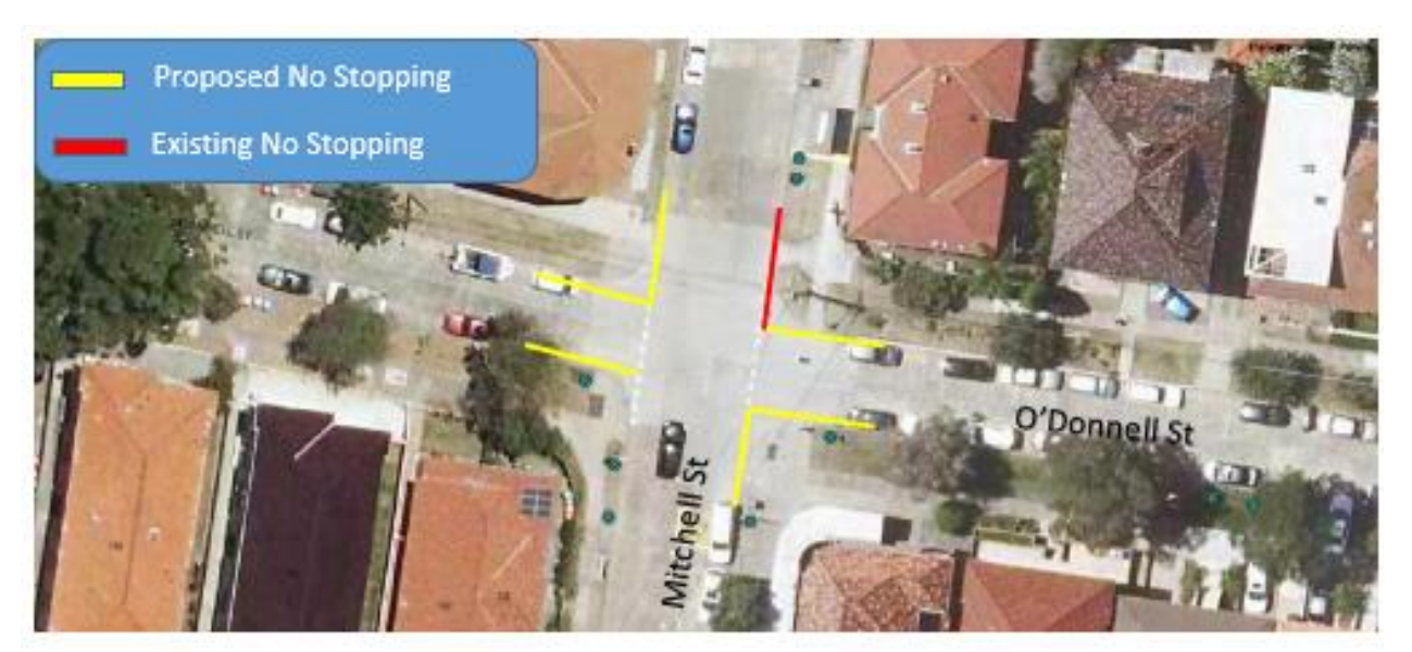
Figure 1.2 Existing and proposed restrictions at Mitchell Street and O'Donnell Street