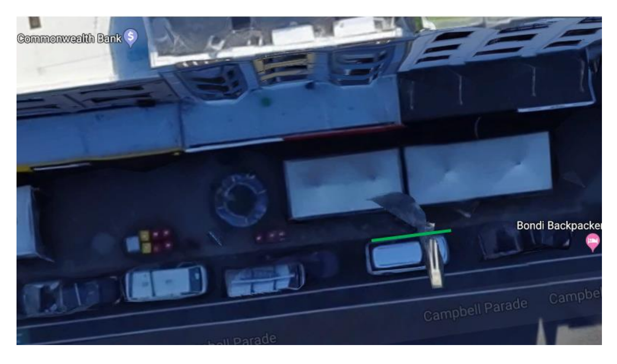
Figure 5. One space outside 110 Campbell Parade.