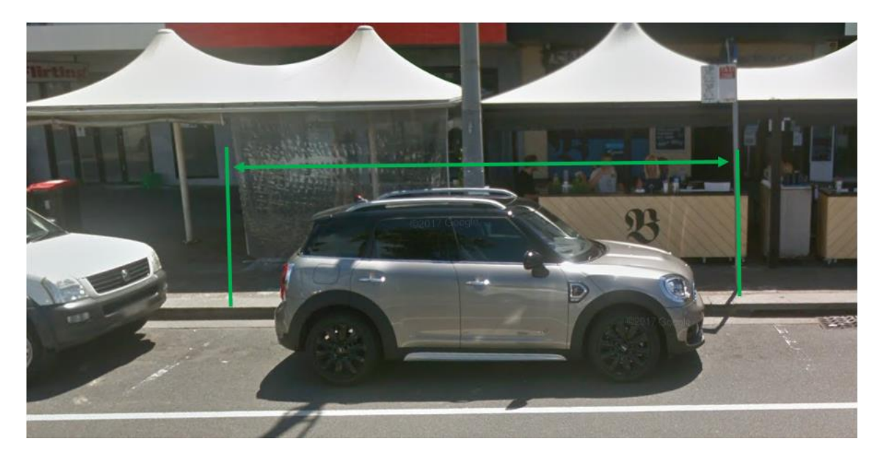
Figure 5. One space outside 110 Campbell Parade.

Outside 110 Campbell Parade, Bondi Beach – Western side, extending 6.5 metres south of the existing taxi zone (1 Space)