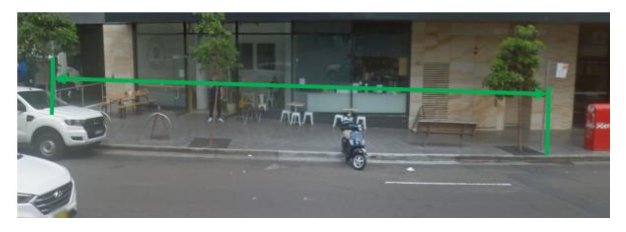
Figure 1. Three spaces Hollywood Ave adjacent to 241 Oxford Street.