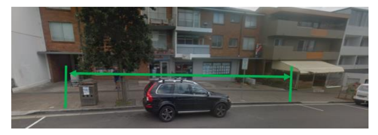
Figure 2. Three spaces outside 51–53 Hall Street.

See the image below of the proposed three spaces on spaces at 51 to 53 Hall Street, Bondi Beach.