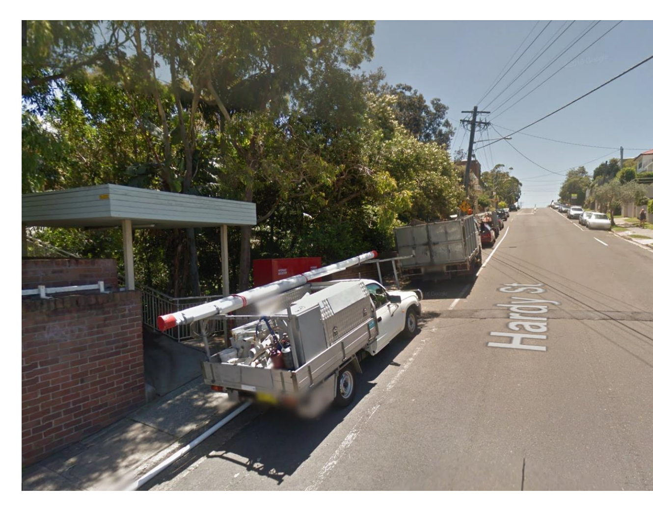
Figure 1. Street view of 24 Hardy Street (multi-storey building).

Table 1. Requests for new 'P Disability Only' zone.