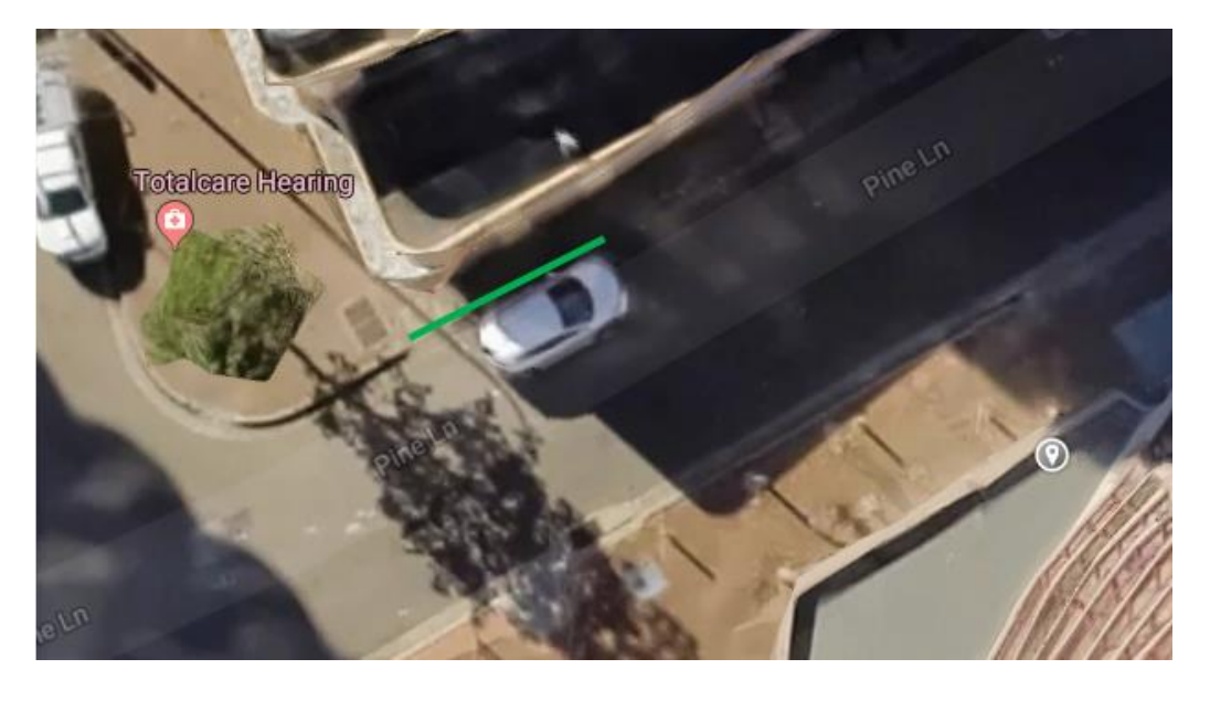
Figure 4. One space Pine Lane.