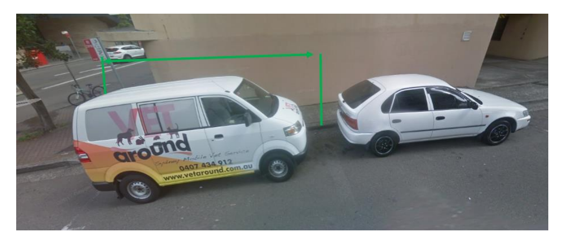
Figure 3: One space Pine Lane.

Pine Lane, Bondi Junction – Northern side of Pine Lane at the intersection with Hollywood Ave extending 6.5 metres east of the current No Stopping (1 space)