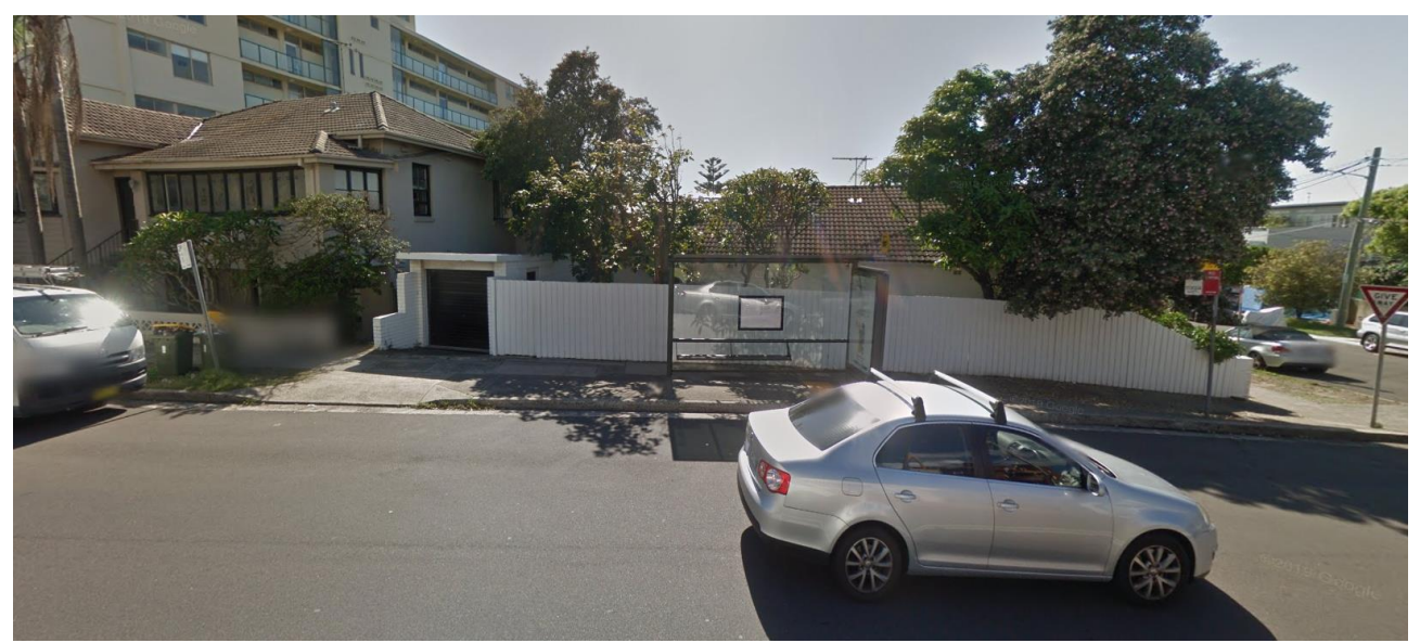
Figure 2. Photo of the existing Bus Zone in Sandridge Street to be changed.

The existing bus stop is located on the eastern side of Sandridge Street immediately north of the intersection with Fletcher Street. It is approximately 21 m in length with 'No Stopping' immediately south of it.