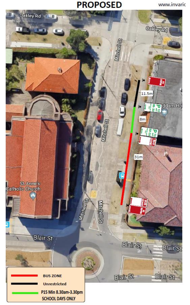
Figure 2: Mitchell Street – Existing and Proposed Parking arrangement.