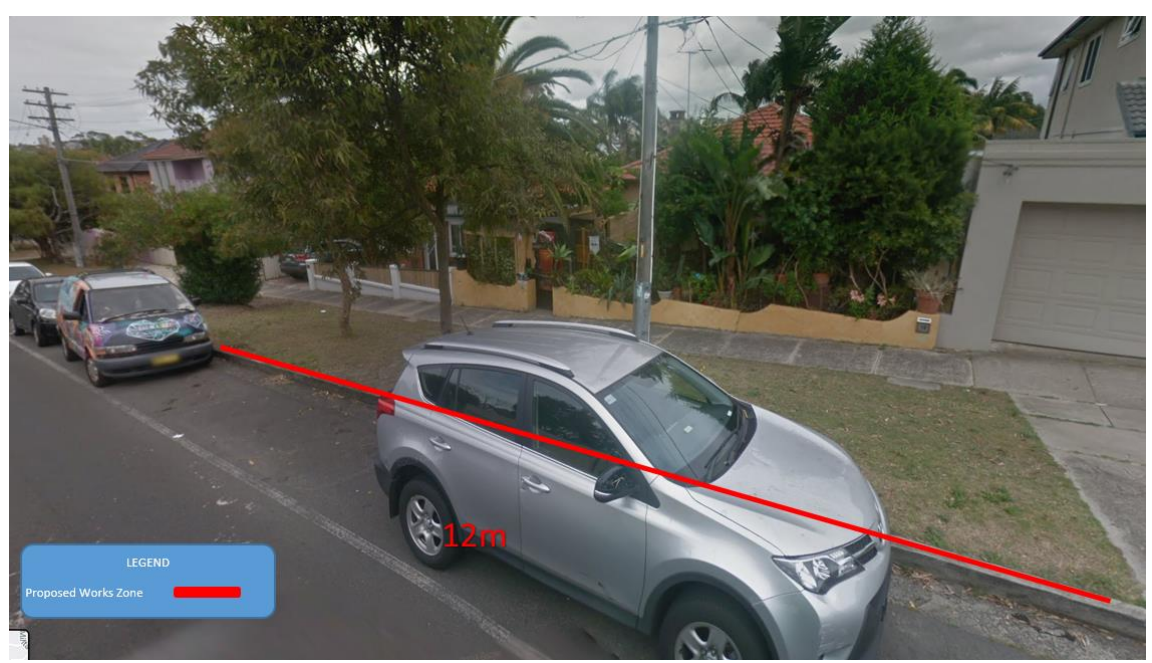
Figure 2: 10 Hardy Street, North Bondi – Proposed construction zone.