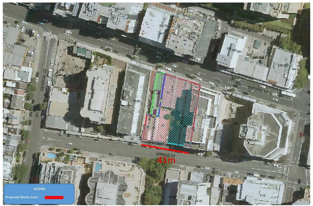
Figure 1: Aerial image of 87 - 99 Oxford Street/16 - 22 Spring Street, Bondi Junction.