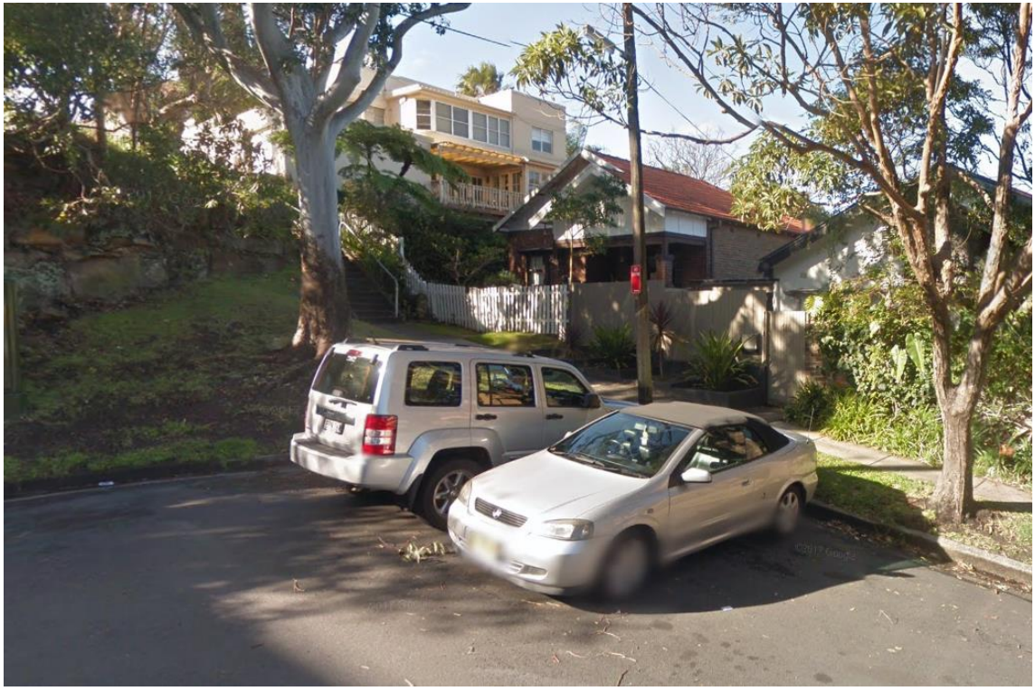
Figure 2. Parked vehicles in Liverpool Street in the vicinity of No. 41A (Right side of image at power pole)