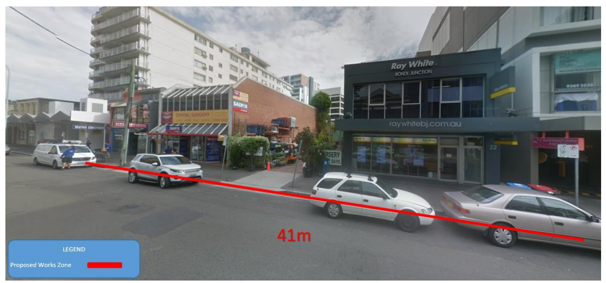
Figure 2: Image of the Spring Street frontage of the site at 87 - 99 Oxford Street/16 - 22 Spring Street, Bondi Junction.

The proposal is to install a 41 metre works/construction zone on the Spring Street frontage of the site. This will remove approximately 5 ticket parking spaces.