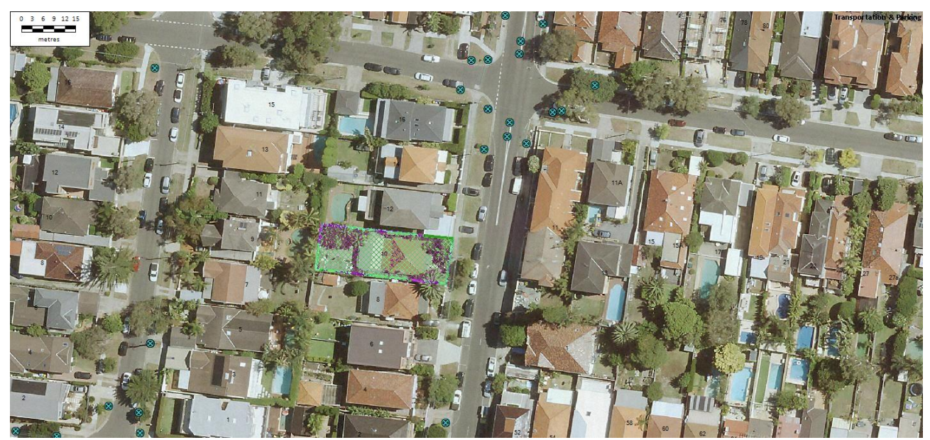
Figure 1: Aerial image of semi-detached dwelling at 10 Hardy Street, North Bondi.

Council has received an application from the builder at 10 Hardy Street, North Bondi for the installation of a construction zone on the site frontage. Council will need to exercise its delegated function to implement the proposal.