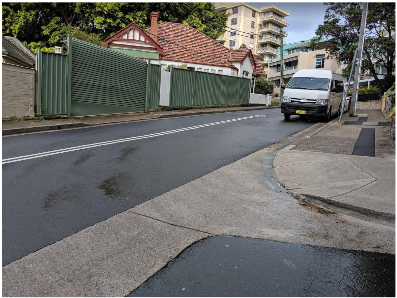
Figure 1. Photo showing sight distance at the intersection of Waverley Crescent and Pine Lane, Bondi Junction.

There are currently 'No Stopping' restrictions at the above intersection. However due to the poor sight lines it is recommended that the existing 10m 'No Stopping' zone be extended by a further 3 metres to increase sight distance for drivers turning from Pine Lane to Waverley Crescent.