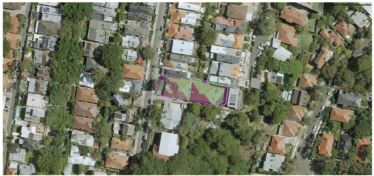
Figure 1: Aerial image of semi-detached dwelling at 38-40 Henrietta Street, Waverley.

Council has received an application from the builder at 38-40 Henrietta Street, Waverley for the installation of a construction zone on the site frontage. Council will need to exercise its delegated function to implement the proposal.