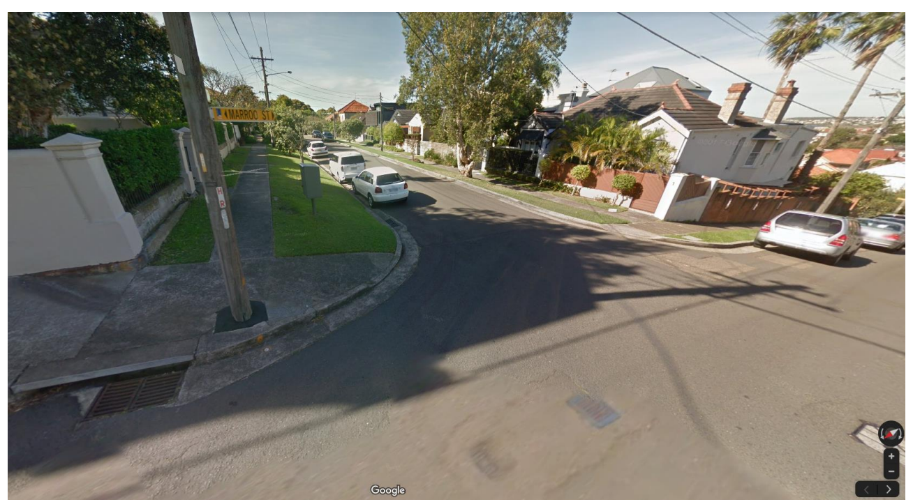
Figure 2. Street view of the intersection of Busby Parade and Marroo Street, Bronte.

As compliance is an issue at this location, it is recommended that the legislative requirements be signposted. This will not result in a net loss of legal, on-street parking spaces.