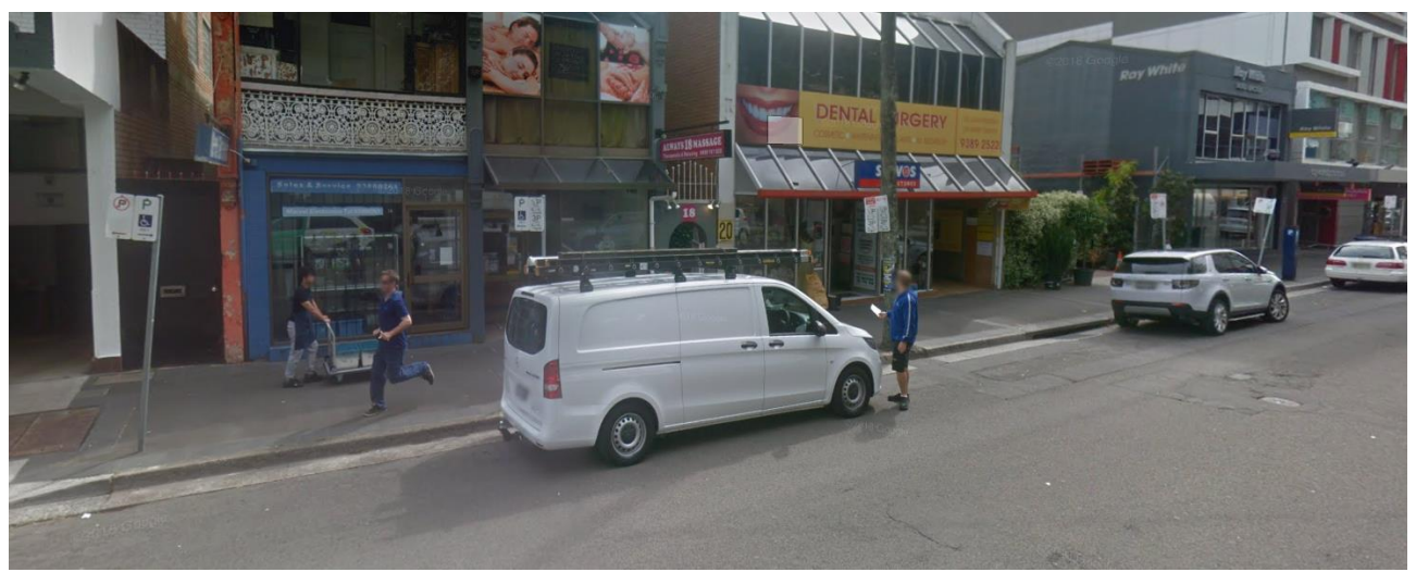
Figure 3: Street view of various parking zones outside 16-22 Spring Street, Bondi Junction.