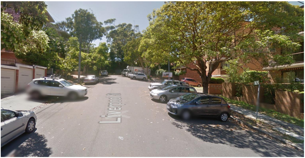
Figure 1: Street view of angle parking on the south (right hand) side