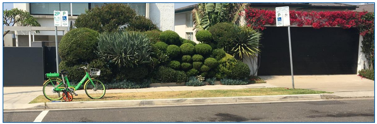
Figure 1: Kenneth Street disabled parking