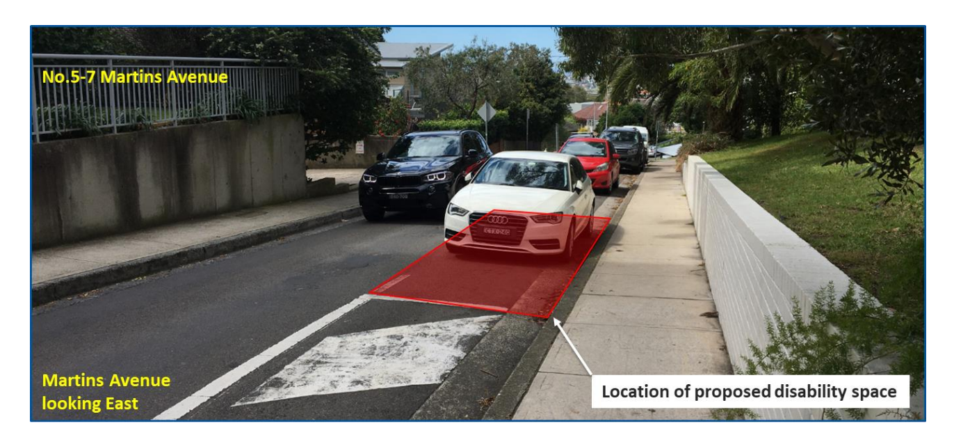
Figure 3. Martins Avenue looking east.

The proposed length is based on Australian Standard AS2890.5-2020 – On-street parking. This is shown in Figure 4.