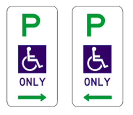
Figure 5. Proposed signage.