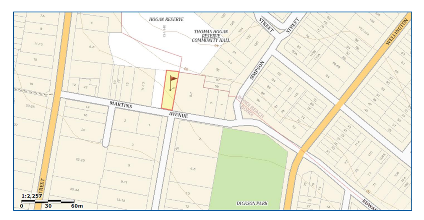
Figure 1. Site location.

Council will need to exercise its delegated functions to implement the proposal.