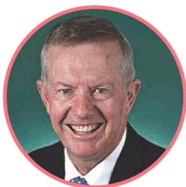
HON MARK COULTON MP

Minister for Regional Health, Regional Communications and Local Government