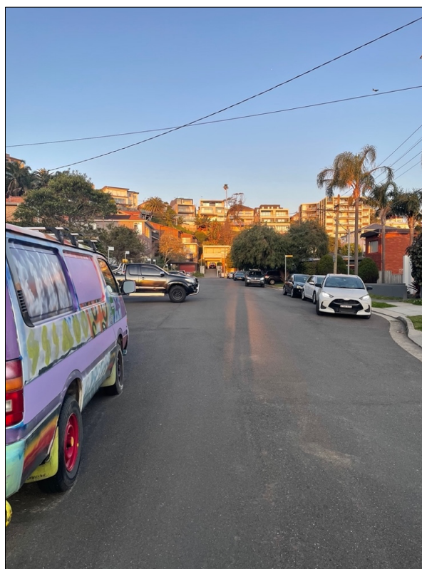
Figure 2 – Current parking congestion along Clyde Street, showing modified parking arrangements with both angled and parallel parking creating safety issues and blind spots for other drivers accessing the street.

It is requested that Council consider undertaking the following modifications to the proposal: