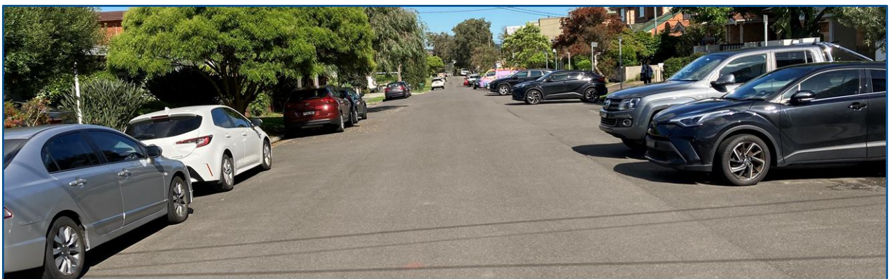
Figure 2. Clyde Street, facing east along the narrow section of the road.

There is no technical reason why the angle parking spaces should be removed. The parking and aisle widths comply with the requirements of Australian Standard AS2890.5 - 2020 - On-street Parking.