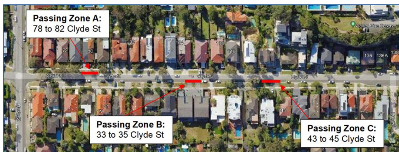
Figure 3. Proposed passing bays in Clyde Street.