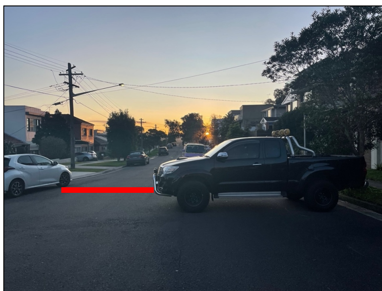
Figure 3 – More appropriate parking solutions are requested to further mitigate risk to children, pedestrians and residents on Clyde Street.

We consider this an impractical solution to the increased parking demands that place further risk to the safety of both children and pedestrians accessing the Child Care centre. See Figure 3.