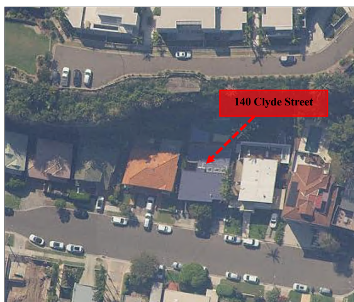
Figure 1 - Aerial of the development at 140 Clyde Street and the already constrained Clyde Street, North Bondi.