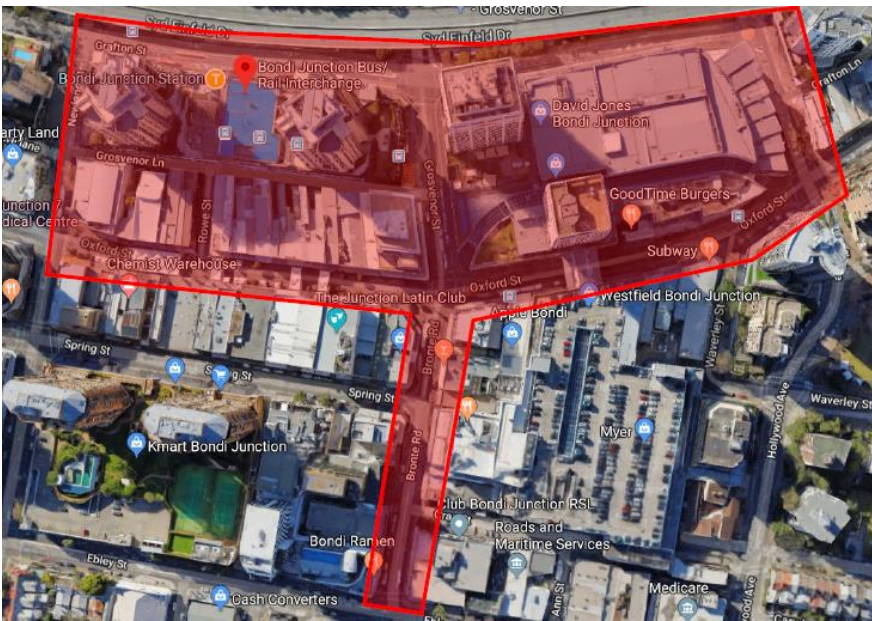
Figure 1. Area in Bondi Junction affected by partial road closures.