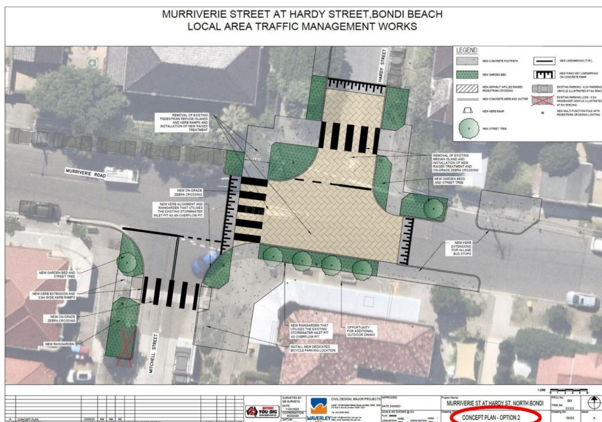
Figure 2. Option 2 - Raised intersection.

These elements will provide traffic calming and slow vehicles through the intersection. This creates a safer road environment for all.